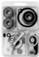
96236 – Motor Tune-Up Kit

Note: Please refer to page 4 of tool manual for specific part number.