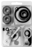
96236 – Motor Tune-Up Kit

Note: Please refer to page 4 of tool manual for specific part number.