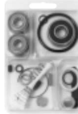
95600 Motor Tune-Up Kit: • Includes assorted parts to help maintain and repair motor.