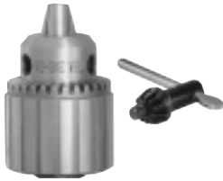
53032 – 1/4" Drill Chuck Includes: 53052 Mated Chuck Key