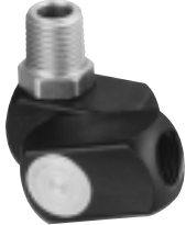
DYNASWIVEL® Swivels 360° at two locations which allows an air hose to drop straight to the floor, no matter how the tool is held. • 94300 1/4" NPT